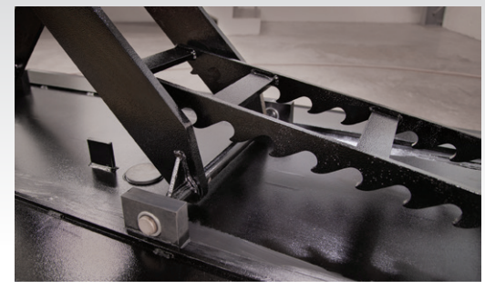
Locks shown in the raised position during lowering of table Compliant with Standards for Garage Faulinment

Compliant with Standards for Garage Equipment - adds additional support and safety guidelines